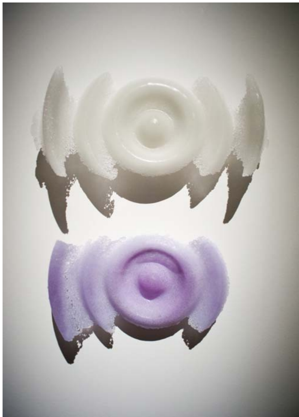
Karen Donnellan, Soffeggio Excerpt I and II , 2012 Cast glass ( pâte de verre ), 18 x 8 x 4 cm, and 14 x 8 x 4 cm.

With origins in the Mediterranean, glass has been created in Europe since millennia, with regional styles vying in competition, through global trade routes, and divergent styles and techniques. Many of the finest collections and collectors are even outside of Europe. A catalogue will aim to make accessible this phenomenon, and study its roots. The goal of European Glass Experience is to link practices in this medium to contemporary art and to foster the role of glass artistry as an intangible cultural heritage to be safeguarded and promoted.