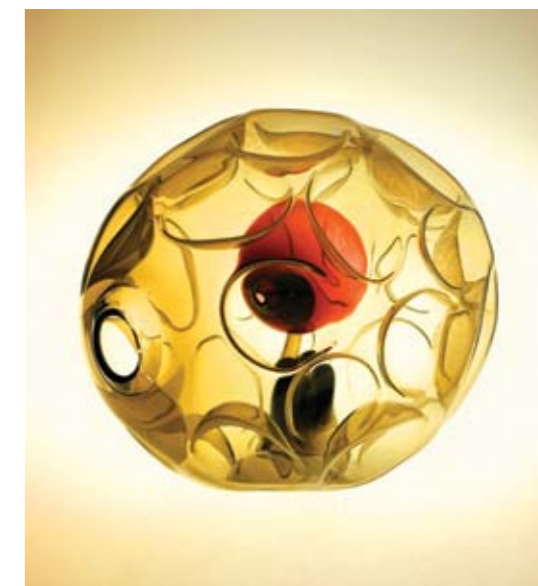
Ales Vacek, Vainglory in Gold , 2013 Amber and red glass, 45 x 40 x 40 cm